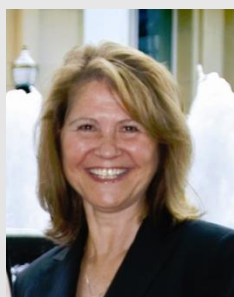
Zedtta Wellman Gratz Park Inn