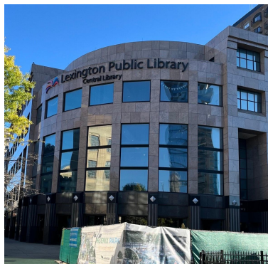
In 2025, the Lexington Public Library will celebrate 120 years of providing books to the community.

The public is invited to the Mayor's press conference for a preview of the fun. Then stay for TNL!